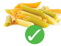
Rice and Pasta