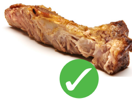
Meat and Fish