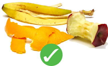
Fruit and Vegetables

All cooked & uncooked food waste such as: