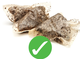
Tea Bags and Ground Coffee